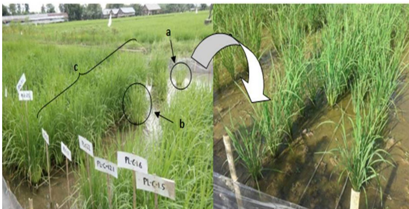
Figure 1. Variations of rice plant phenotypes at 40 days after planting (a) dwarf-type, (b) semi-dwarf type, (c) normal type